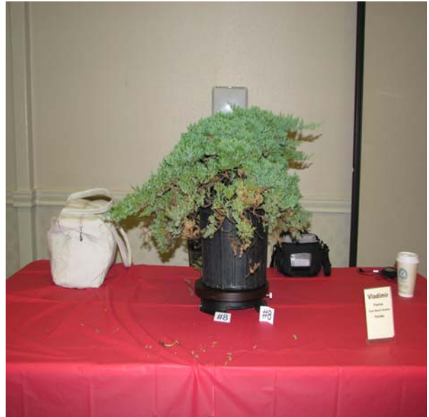
Vlad's winning tree, BEFORE.