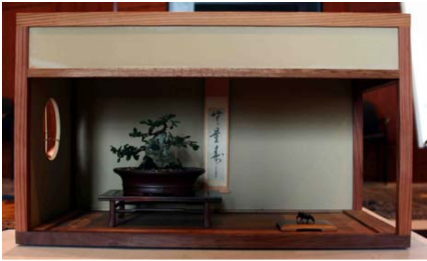
A really cool miniature display.