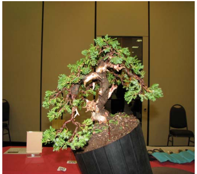
Vlad's winning tree AFTER.