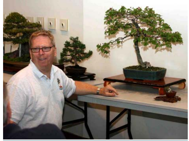
There were lots of questions from everyone interested in learning proper display technique.