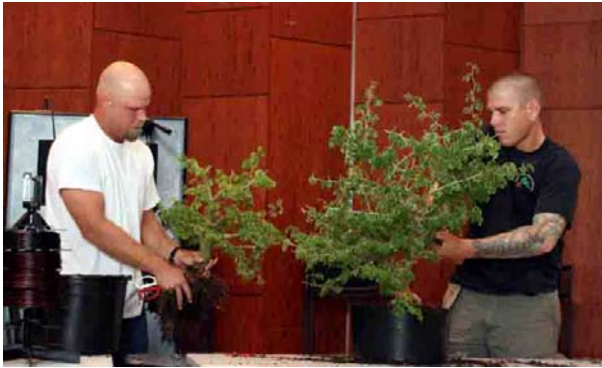
Let the dueling begin!